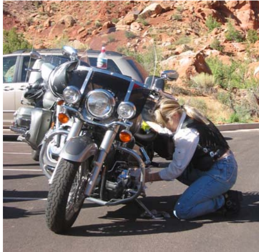
It's like everytime I ride - it gets dirty!