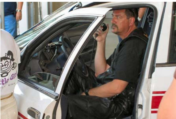
Can you hear me now?!

Back to Moab for lunch and then a ride out to the Castle Creek Winery. Another great little ride – winding roads with sheer cliffs on one side and the Colorado River flowing down the other. After doing some wine tasting, back to Moab we went. We ate, we shopped, we laughed, and shopped some