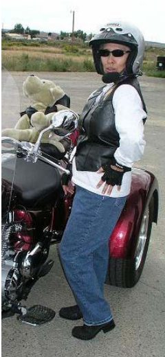
Is this my best side?