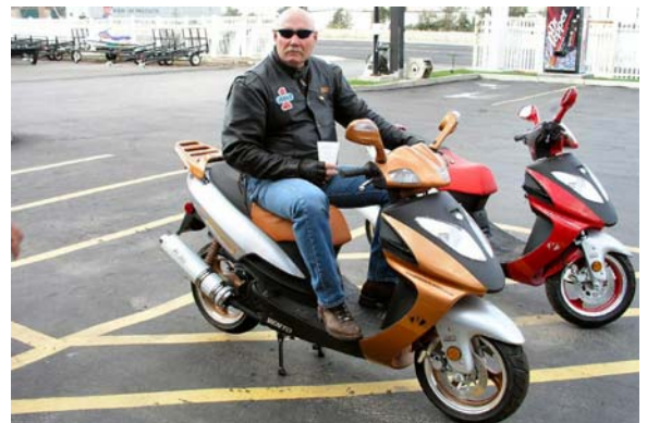
...and this one is just right!

I am sooo looking forward to next years Redwood Ride!